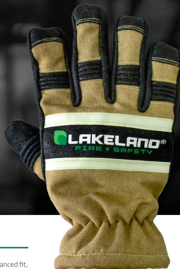
ETF3200 style shown