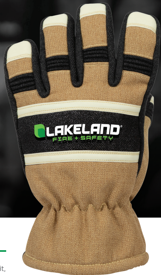
NFPA3200 style shown